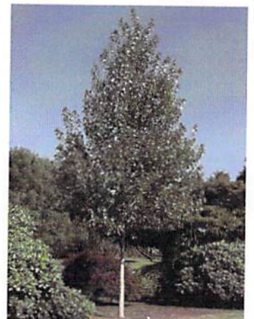
Redpoint Red Maple