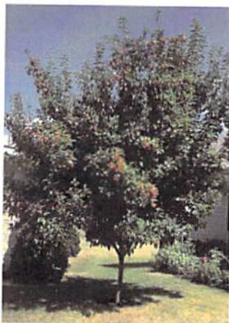
Hot Wings Maple