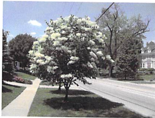
Ivory Silk Lilac