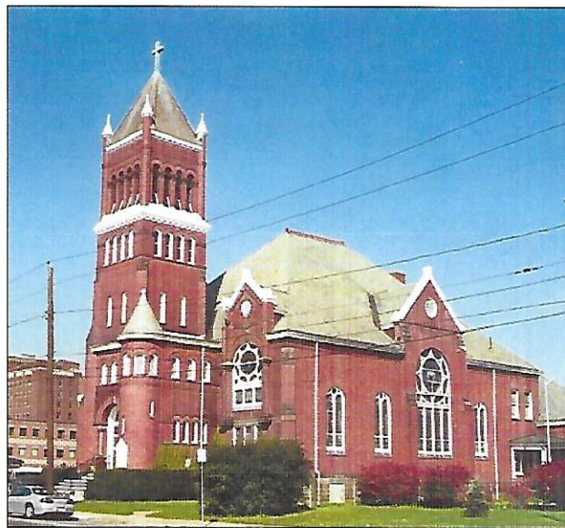
The German Evangelical Church (now the First United Church of Christ) on Madison Avenue in Elmira.