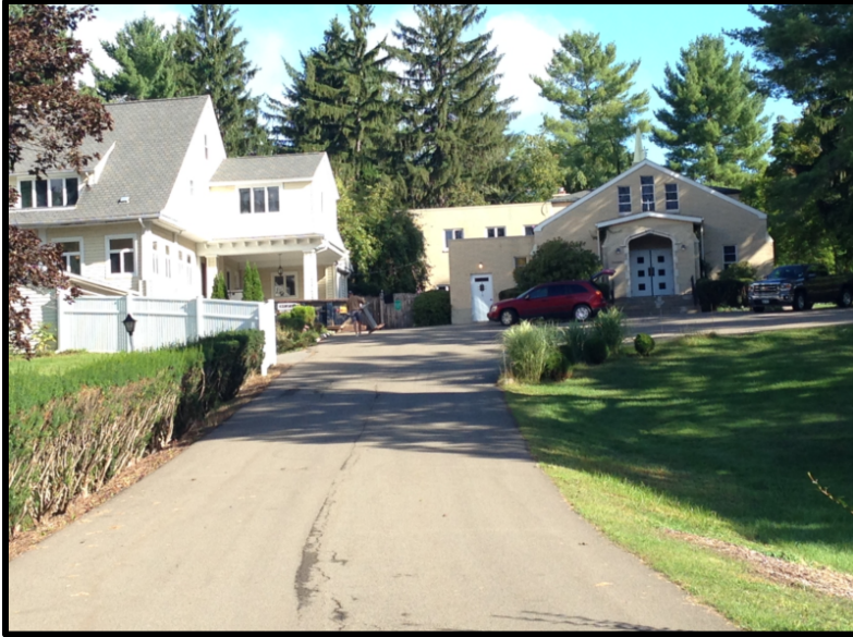
The Monastery and Chapel in 2014