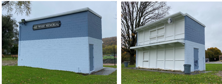
Art Whirt Memorial- being re-painted in October 2021